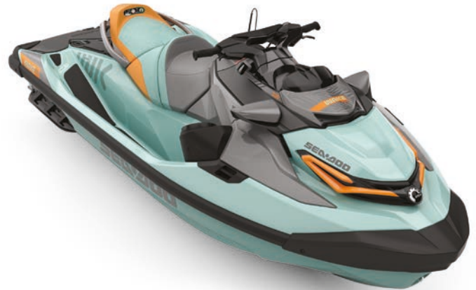
● Neo Mint